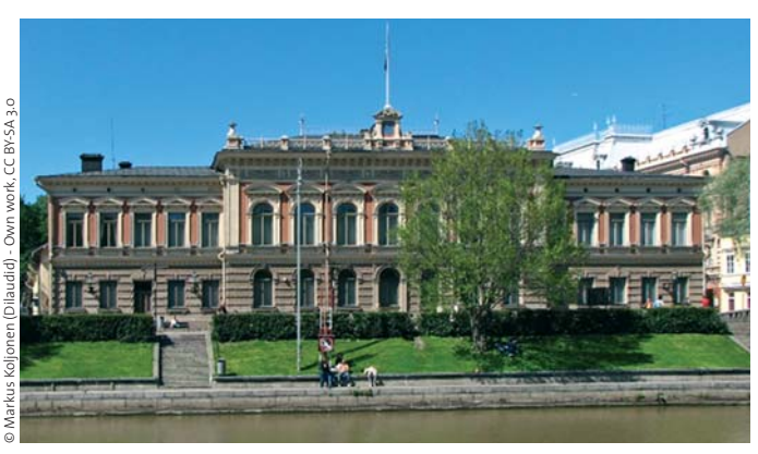
Turku City Hall