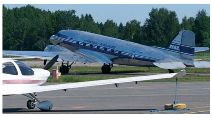
DC 3 aircraft

N.B.: Helsinki-Malmi Airport was listed among Europa Nostra's 7 Most Endangered sites in Europe in 2016