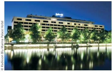
Radisson Blu Marina Palace Hotel